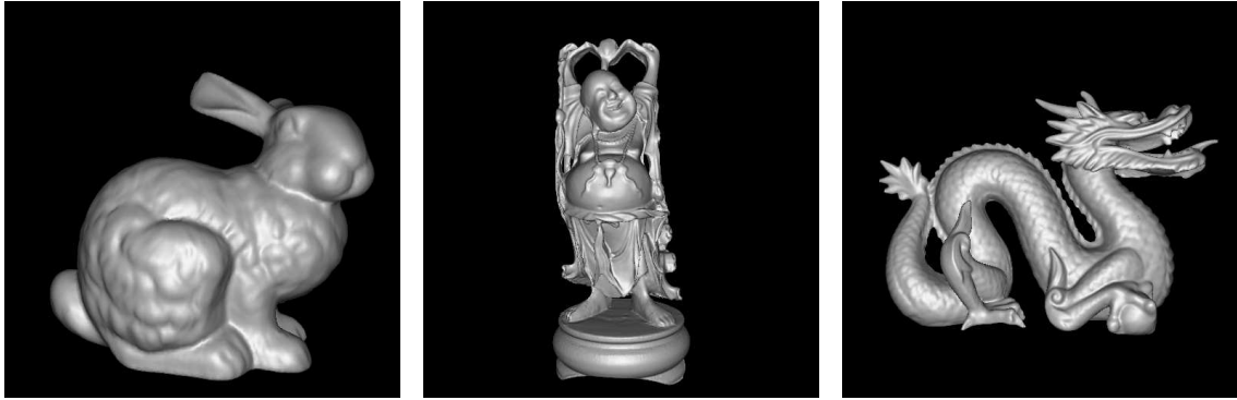
Figure 3: Stanford scenes: Bunny, Buddha, Dragon.