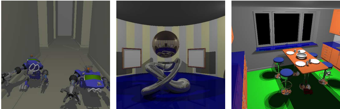
Figure 4: BART scenes: Robots, Museum, Kitchen.