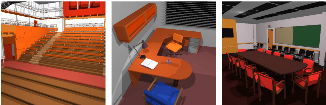
Figure 5: MGF scenes: Theatre, Office, Conference Room.