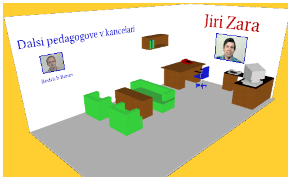
Fig. 3: An office with 3D multimedia information objects